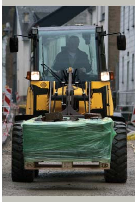
Precision and power.