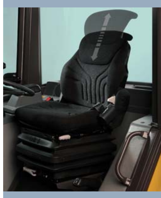
Adjustable sprung seat to suit each operator.