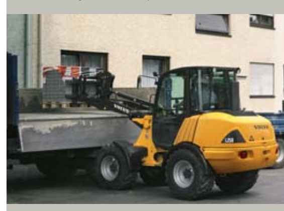
Long reach for loading, unloading,